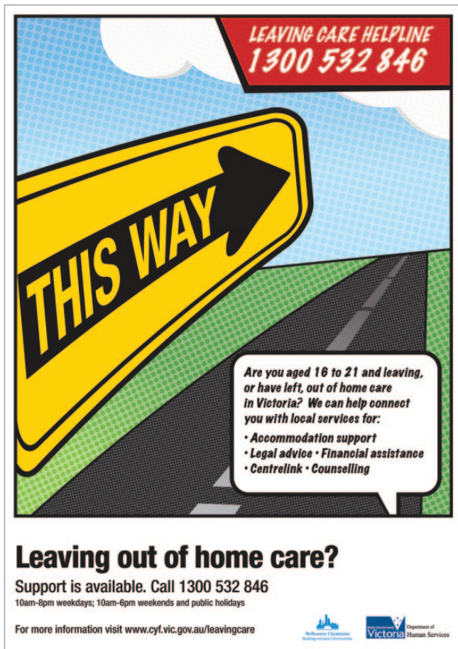
Example of Leaving Care Helpline poster

To order more A4 or A3 posters and regional wallet cards for young people in your area email: maria.trombin@dhs.vic.gov.au