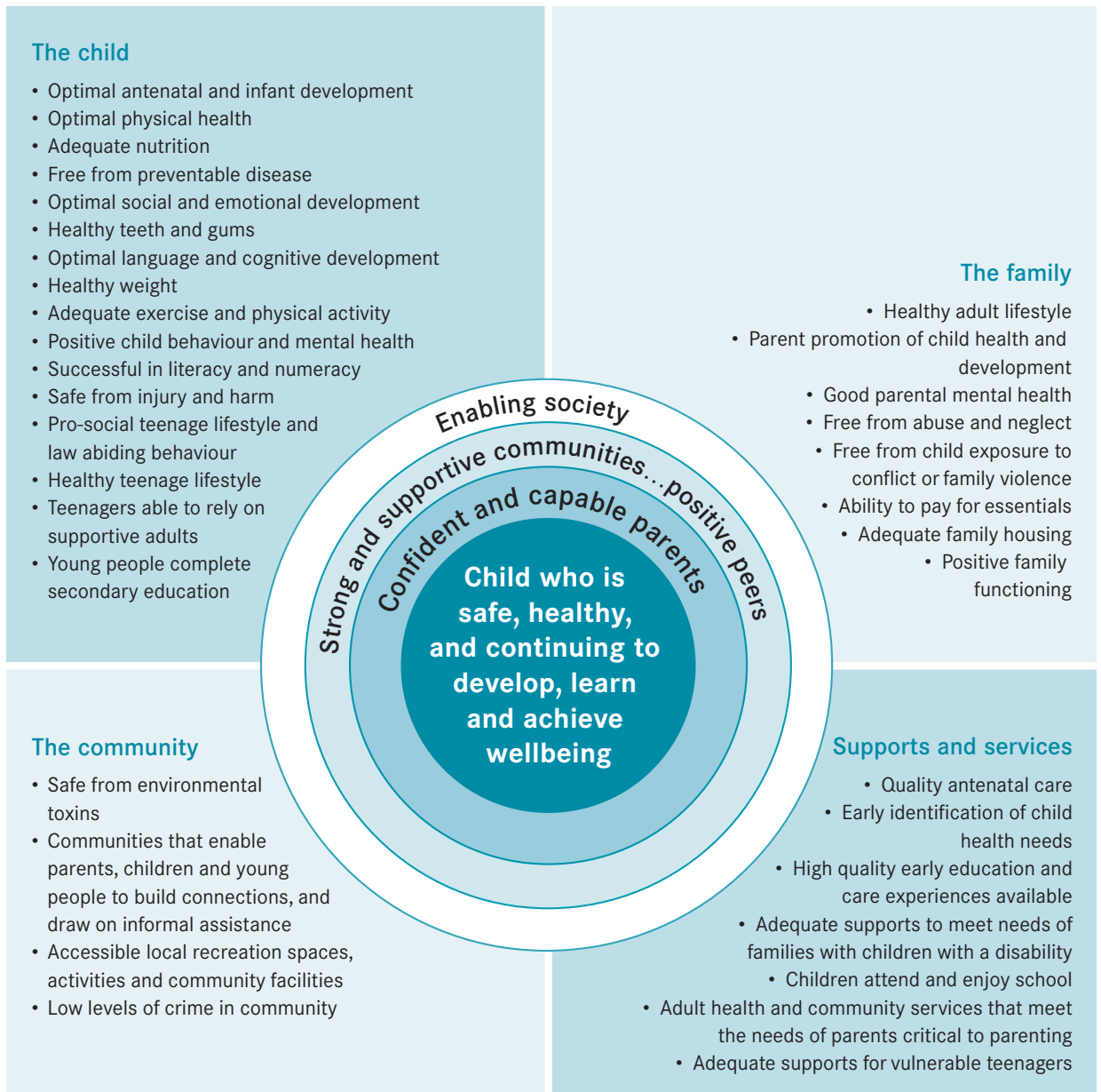
Figure 1 - Key features

The development of the Victorian children’s outcomes framework will provide a common basis for setting objectives and planning across the whole of government. Its key features are outlined below. 3